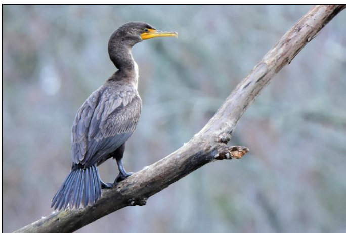
There are many Cormorant birds on the paddle to Russellville Flats.