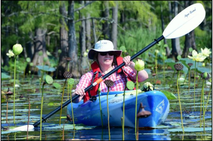
Paddling through fields of beautiful Golden Lotus in Russellville Flats.