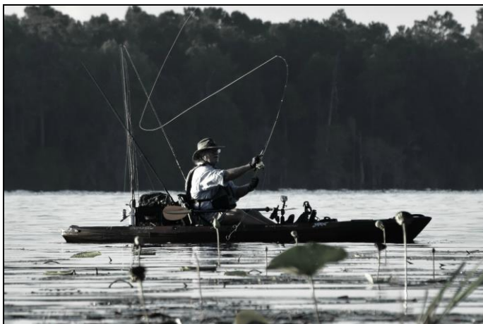
Early morning kayaker fly fishing at Russellville Flats on Lake Moultrie.